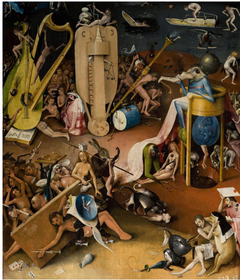
Bosch actually includes a Hurdy-Gurdy in his painting Garden of Earthly Delights